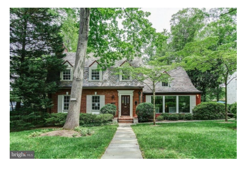
5633 Lambeth Road

Sold Price: $1,155,000 Orig Price: $1,000,000 Days on Market: 8