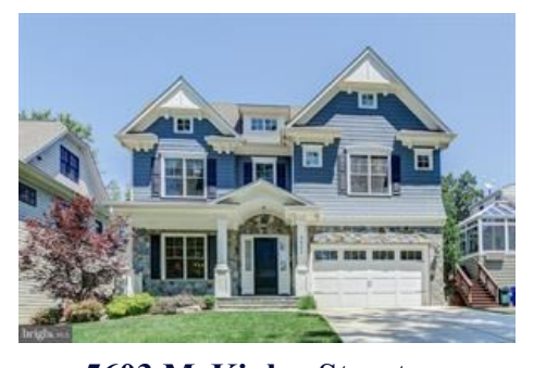
5603 McKinley Street

Sold Price: $1,299,000 Orig Price: $1,349,000 Days on Market: 15