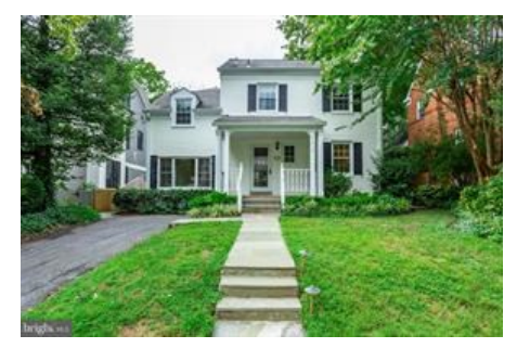
7812 Custer Road

Sold Price: $1,200,000 Orig Price: $1,200,000 Days on Market: 2