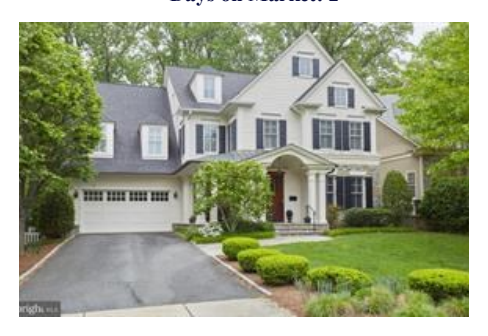
7723 Oldchester Rd.

Sold Price: $1,4500,000 Orig Price; $1,450,000 Days on Market: 2