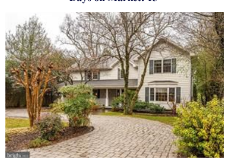
8009 Custer Road

Sold Price: $1,260,000 Orig Price: $1,245,000 Days on Market: 15