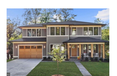
7834 Aberdeen Road Sold Price: $2,400,000 Orig Price; $2,575,000 Days on Market: 151

PRSRT STD U.S. POSTAGE PAID Suburban, MD Permit No. 4615