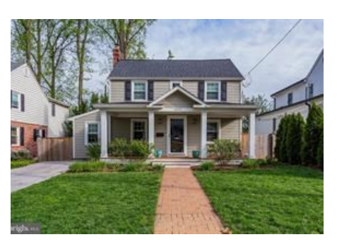
5515 Northfield Road

Sold Price: $1,850,000 Orig Price: $2,150,000 Days on Market: 212