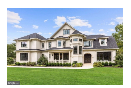
5609 Wilson Lane Sold Price: $2,898,000 Orig Price: $2,898,000 (Orig price higher in 2018) Days on Market: 49+