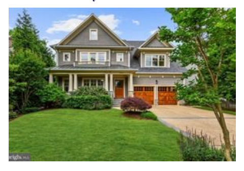
7707 Radnor Road

Sold Price: $1,570,000 Orig Price: $1,595,000 Days on Market: 23