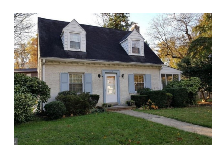
5714 Glenwood Road Sold Price: $765,000

If you're weighing whether to market your home to the public as well as to builders, keep in mind that often times, even after accounting for payment of a commission and other costs associated with the sale, a Seller nets more from a sale to buyers who intend to live in the property. Beware of smoke and mirrors; any agent worth his/her salt can make the sale as "easy and hassle free" as promised by our builders. As you know, Our Neighborhood is very desirable and there are many buyers who, if given the chance, would pay more - often significantly more - than a builder, even for a less than ideal house. Each situation is unique and deserves a careful analysis. Please feel free to give me a call; I'd enjoy visiting with you and answering any questions you might have.