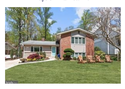
5601 Huntington Pkwy

Orig Price: $839,000 Days on Market: 129