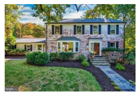
5500 Huntington Pkwy

Sold Price: $1,260,000 Orig Price: $1,225,000 Days on Market: 4