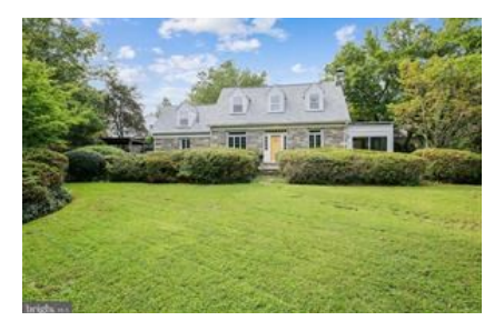
5703 Maiden Lane

Sold Price: $1,000,000 Orig Price: $1,050,000 Days on Market: 6