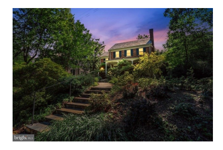
7823 Overhill Road

Sold Price: $819,000 Orig Price: $799,000 Days on Market: 2