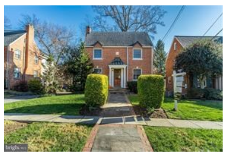
7815 Stratford Road

Sold Price: $1,$1,265,000 Orig Price: $1,200,000 Days on Market: 8