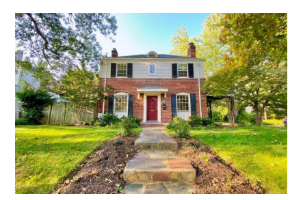
5801 Roosevelt St.

Sold Price: $925,000 Orig Price: $999,000 Days on Market: 26