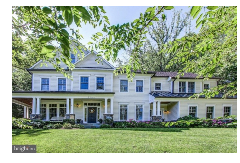
5500 Lambeth Lane

Sold Price: $1,699,000 Orig Price; $1,795,000 Days on Market: 35