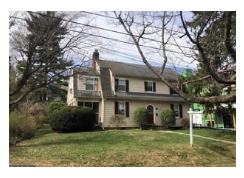
8004 Maple Ridge Road

Sold Price: $1,155,000 Orig Price: $1,000,000 Days on Market: 8