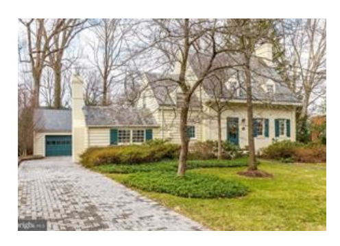
8020 Hampden Lane

Sold Price: $1,900,000 Orig Price: $2,000,000 Days on Market: 41