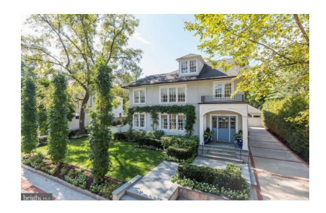
5203 Battery Lane Sold Price: $2,995,000 Orig Price: $2,995,000 Days on Market: 3

Whether you're buying or selling, it's almost inevitable that issues will crop up along the way. Fortunately, when this happens, I'm able to draw on my extensive legal background. If I can't resolve the issue(s) outright, I'm usually able to find a way around or over them in order to get to a successful settlement. Here's a comment I received recently following the conclusion of a complex transaction: